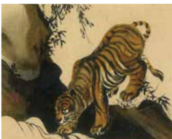
Shibata Zeshin, An Album of Illustrations (from an album of 12)