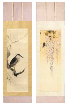
Watanabe Seitei, Wisteria and Old Willow Tree

Despite their overwhelming success in the West and the subsequent impact of Japonisme, the exclusion of these artists from mainstream modern Japanese art history allowed for them to be overshadowed for a long time. Thankfully, in recent years, their works have gone re-evaluation and have rightfully regained mass recognition. We welcome you all to take this rare opportunity to collectively witness the works of three esteemed artists, who continue to stun audiences across many generations and cultures.