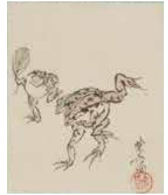
Kawanabe Kyosai, Frog Sumo

Kyosai grew up in Edo. He studied Kano school painting and, following graduation, gained popularity through the caricatures and nishiki-e (colored woodblock prints) he began creating towards the end of the Edo period. In the west, he is best known for his ukiyo-e and caricatures. His works often center upon ideas of "rebellion" and "satire". Sharp and armed with extraordinary artistic talent, the impact of Kyosai's satirical works has proved to increase over the increment of time. Amongst his pupils was Josiah Conder, an architect best known for his many designs of modern Japanese landmarks, i.e. Rokumeikan.