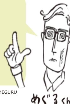
The Official MEGURU Character

Whether it's a painting, pottery, or tea ware, if you are interested in consigning your work for auction, please feel free to contact us. Consultations and assessments are free, so do take this opportunity to inquire.