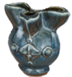
Kawai Kanjiro, Gosu Pot

Kawai Kanjiro, the potter and "poet of earth and fire". Alongside Yanagi Soetsu and Hamada Shoji, he was a vanguard of the Mingei movement. From ceramics to calligraphy, and wood carvings, Kawai explored the "beauty of function" in everyday life through wide-ranging forms of expression.