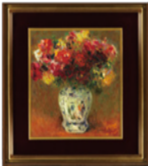
Yamamoto Hyoichi, Roses