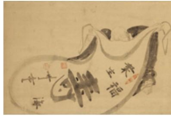
Hakuin Ekaku, Hotei (God of Fortune)

Gibon, and disciples of Hakuin, such as Torei Enji, this MEGURU offers a vast collection of Zen paintings, calligraphy, and other works that convey Zen teachings. What spiritual advice can these works offer us in this time of immense change? Come have a look!