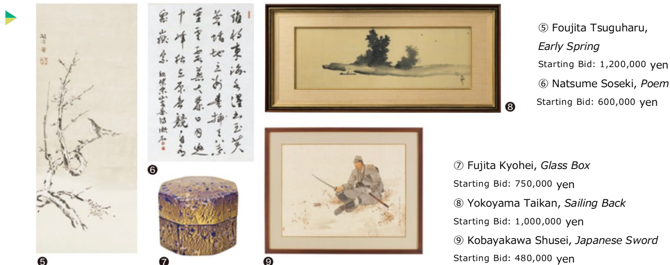
⑤ Fougita Tsuguharu, Early Spring