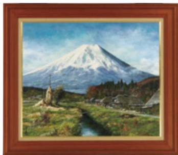
Hayashi Kiichiro, Mt. Fuji