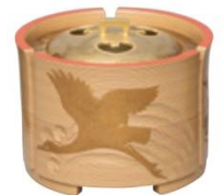
Otomaru Kodo, Tsuishitsu Incense Burner with Auspicious Motif