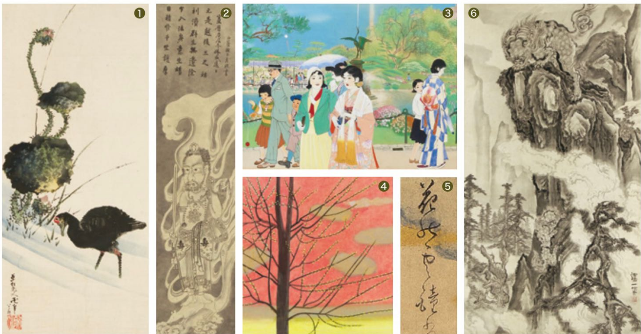
① Katsushika Hokusai, Water Rail and Plants

Color on paper. Image 61×28 cm / Overall 151×39 cm