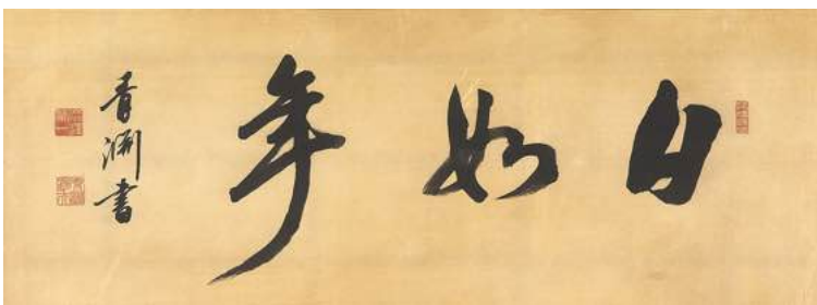
Shibusawa Eiichi, Calligraphy Starting Bid: ¥120,000