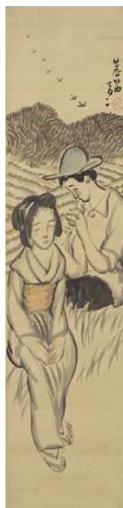
Takehisa Yumeji, Whistle at Sunset Starting Bid: ¥2,200,000