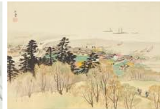
Kawai Gyokudo, Spring Scenery Starting Bid: ¥1,800,000