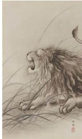
Hashimoto Gaho, Lion Starting Bid: ¥650,000

Regarded as the father of modern Japanese painting, Hashimoto Gaho was a supporter of Okakura Tenshin's Japan style painting reform movement during the Meiji period. He taught at the Tokyo Fine Arts School (current Tokyo University of the Arts) and focused on fostering artists who would come to represent Japanese art, such as Yokoyama Taikan, Hishida Shunso, and Shimomura Kanzan. Amongst Gaho's many discoveries, was the artist, Kawai Gyokudo. Gyokudo, who studied under Kono Bairai in Kyoto, was taken by Gaho's Dragon and Tiger folding screen, which he viewed at the National Industrial Exposition, and he decided to go to Tokyo to meet Gaho. Under Gaho's tutelage, he completed a new landscape painting that fused Gaho's Kano school aesthetic with the Shijo school style that he cultivated. This MEGURU will offer approx. 20 works including landscape and animal paintings by Gaho and Gyokudo.