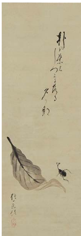
Sakai Hoitsu, Magnolia Leaf and Insect Starting Bid: ¥800,000

Founded during the late Momoyama period by Hon'ami Koetsu and Tawaraya Sotatsu, the Rimpa aesthetic and movement established great success in the mid-Edo period through the works of Ogata Korin and Ogata Kenzan, and, subsequently, Sakai Hoitsu and Suzuki Kiitsu. A movement crafted by artists who, did not form a hereditary school, but who worked in a particular style, Rimpa works are renowned for their lavish and elegant designs, and famed for their highly distinct Japanese aesthetic. This MEGURU offers roughly 20 lots, mainly by artists of the late Edo period, such as Sakai Hoitsu, Suzuki Kiitsu, Ikeda Koson, and Nakamura Hochu.