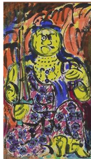
Munakata Shiko, Fudo Myoo Starting Bid: ¥4,000,000