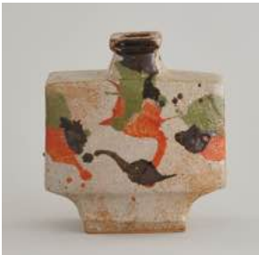
Kawai Kanjiro, Tricolor Flask Starting Bid: ¥3,000,000