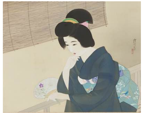
Ito Shinsui, Cool Breeze Starting Bid: ¥1,800,000