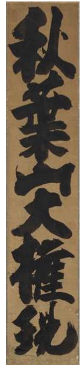
Hakuin Ekaku, Calligraphy Starting Bid: ¥450,000