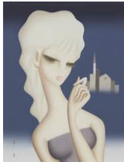
Togo Seiji, Tower Starting Bid: ¥1,500,000