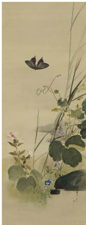
Watanabe Seitei, Autumn Plants and Butterfly Starting Bid: ¥500,000