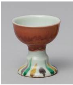
Kitaoji Rosanjin, Overglaze Enamel Stem Cup Starting Bid: ¥250,000