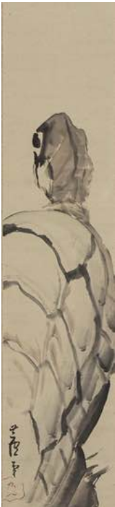
Nagasawa Rosetsu, Turtle Starting Bid: ¥800,000