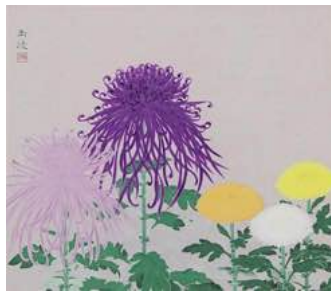
Nakamura Gakuryo, Chrysanthemum Starting Bid: ¥1,800,000