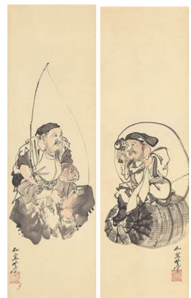
Kawanabe Kyosai, Ebisu and Daikoku (God of Wealth) Starting Bid: ¥380,000