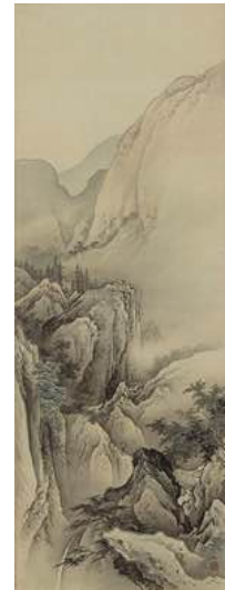
Hashimoto Gaho, Summer Mountain Travel Starting Bid: ¥1,200,000