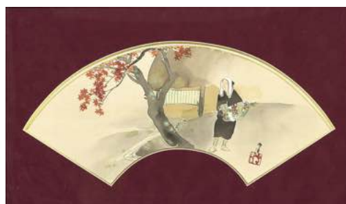
Kamisaka Sekka, Autumn Foliage and Oharame Starting Bid: ¥200,000