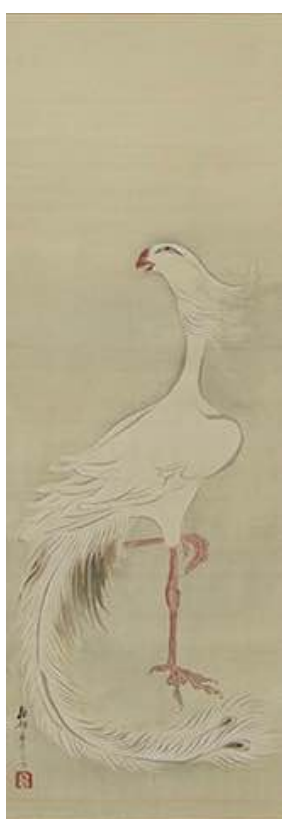
Ikeda Koson, Dragon, Kirin and Phoenix Starting Bid: ¥1,800,000