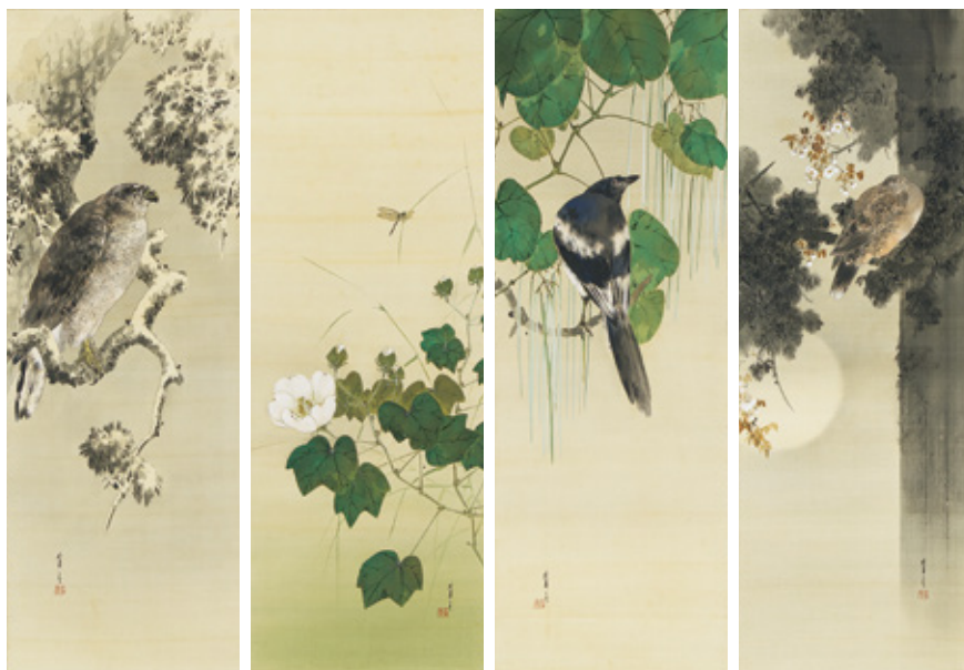
Watanabe Seitei Flowers and Birds of the Four Seasons

Marking the fourth of the series, this exhibition features approximately 15 works by Seitei including a rare quadtych, Flowers and Birds of the Four Seasons (Spring: Dove on Cedar Tree, Summer: Winged Bean and Magpie, Autumn: White Hibiscus, Winter: Hawk on Pine Tree). Also on view, are the works by other virtuosos such as Maruyama Okyo, Nagasawa Rosetsu, Araki Kanpo, Shiba Kokan, Kaburaki Baikei and more. Come experience the world of flower-and-bird paintings through the artists' keen observant eye, excellent brushwork and gorgeous colors.