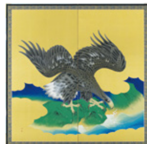
Kodama Kibou, Eagle (Left side of a two-piece folding screen)