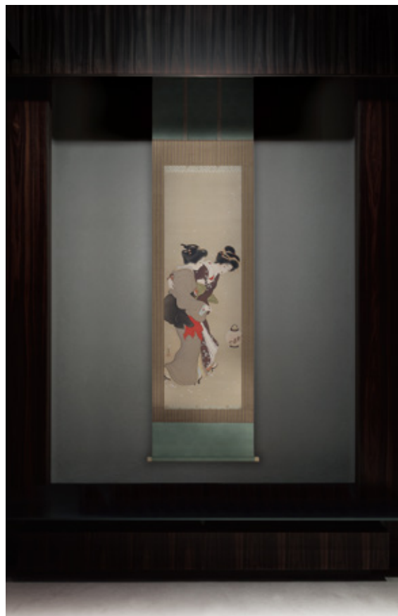
Uemura Shoen, Spring in Kuruwa (Red-light District)