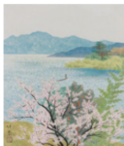
Ono Chikkyo, Lakeside in Spring