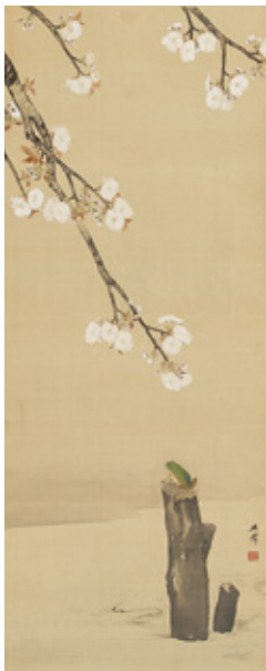
Mikuma Katen, Frog and Cherry Blossoms