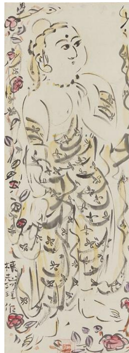
Munakata Shiko, Buddhist Painting