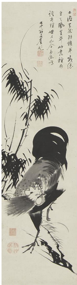
Ito Jakuchu and Musen Jozen, Bamboo and Rooster