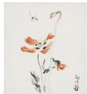
Foujita Tsuguharu, Poppy Flower and Bee