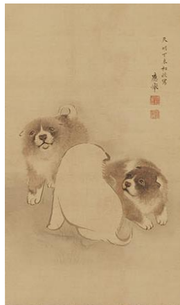
Maruyama Okyo, Puppies