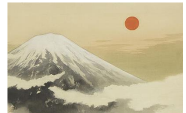
Yokoyama Taikan, Rising Sun and Mt. Fuji