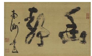
Saigo Nanshu, Calligraphy