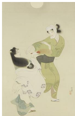
Uemura Shoen, Bon Odori (Bon Festival Dance)