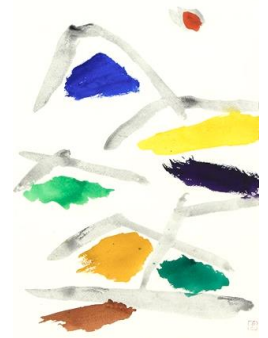
Yamaguchi Takeo, Work