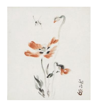
Foujita Tsuguharu, Poppy Flower and Bee