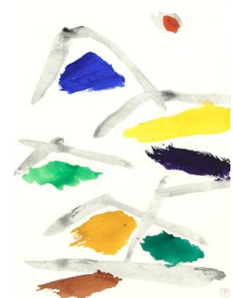
Yamaguchi Takeo, Work