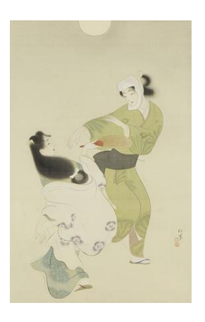
Uemura Shoen, Bon Odori (Bon Festival Dance)