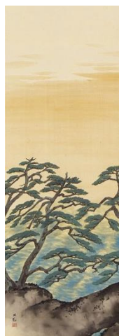
Yokoyama Taikan, Tokai Morning Starting Bid: ¥3,800,000