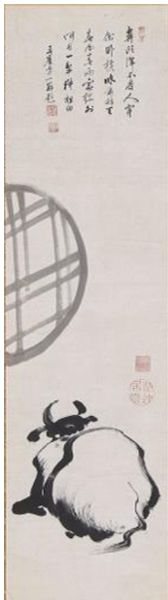
Ito Jakuchu, Musen Jozen, Cattle and Round Window Starting Bid: ¥2,500,000