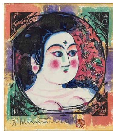
Munakata Shiko, Dianthus Starting Bid: ¥7,000,000