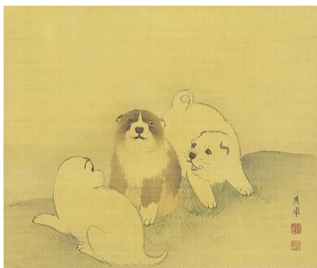
Maruyama Okyo, Puppies Starting Bid: ¥3,800,000