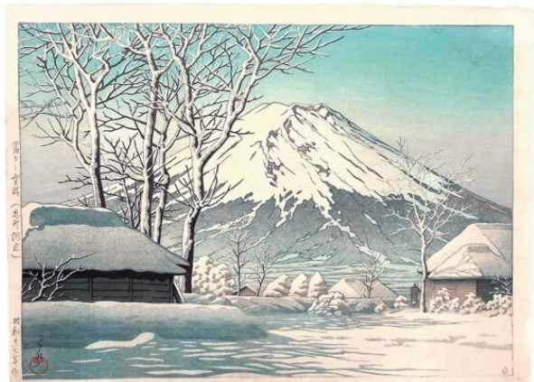
Kawase Hasui, View of Mt. Fuji From Oshino on a Sunny Snowy Day Starting Bid: ¥450,000

The popularity and demand for Ukiyo-e prints gradually decreased after Edo era, but the influx of Western photography and printing technology contributed to the resurgence of printing art. Led by print publisher, Watanabe Shozaburo, the new art movement, Shin-Hanga (lit. New Prints) revived the long forgotten artform by incorporating the traditional woodblock print techniques of the Edo period and new sensibility that resulted in refined colors and lyrical landscapes. In this collection, we will present some of the major Shin-Hanga artists including Kawase Hasui, Yoshida Hiroshi, Kasamatsu Shiro, and others.