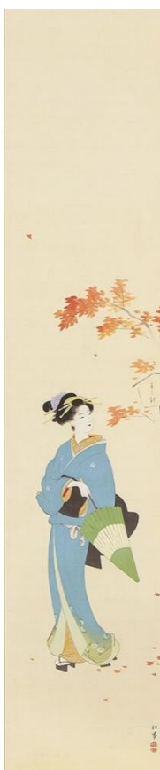
Uemura Shoen, Beauty in Autumn Starting Bid: ¥7,000,000