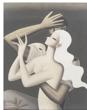
Togo Seiji, Man and Woman Starting Bid: ¥2,000,000