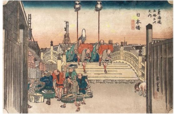
Utagawa Hiroshige, Fifty-three Stations of the Tokaido: Morning Scene at Nihonbashi Bridge Starting Bid: ¥28,000

This MEGURU features the Fifty-three Stations of the Tokaido, which brought Utagawa Hiroshige, the leading ukiyo-e artist, into the limelight. Hiroshige's skillful depiction of the changing seasons, climate, and time of day, as well as his emotionally rich depictions of landscapes interwoven with everyday people and nature must have been undoubtedly appealing to all in Edo, as well as the viewers today. In this MEGURU, the collection features 42 of the 55 prints.