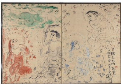
Munakata Shiko "Women"

We are pleased to present a diverse lineup of 13 works by Munakata Shiko, including woodblock prints, paintings, and a two folding screen, allowing you to enjoy his wide variety of works. In addition, there is an impressive collection of 21 pieces by Hamada Shoji, ranging from flat vases to flower vases, painted plates, tea bowls, and teacups.