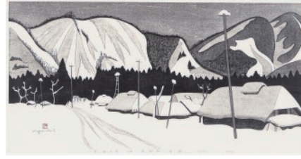
Saito Kiyoshi "Winter in Aizu(98)Hongocho Makoshi"