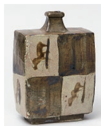
Hamada Shoji "Iron Glazed Bottle Vase with Checkered Pattern"