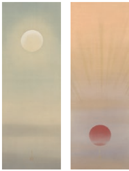
Kimura Buzan "Rising Sun, Bright Moon"

● Modern painting | The highlight of the modern paintings includes "Mt. Fuji from Miho" by Yokoyama Taikan, which depicts the view of Mt. Fuji from Miho no Matsubara, where it is now a renowned world heritage site. In addition, we have a large lineup of works by Saito Kiyoshi, who introduced modern Japanese printmaking to the world, including "CAT (1)" and the "Winter in Aizu" series.