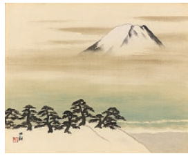
Yokoyama Taikan "Mt. Fuji from Miho"