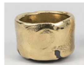
Miwa Kyusetsu XII