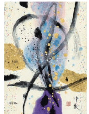
Domoto Insho 《Wind Ensemble》