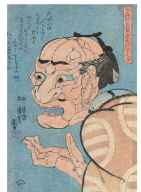
Utagawa Kuniyoshi 《He looks scary, but he's actually a really nice person》