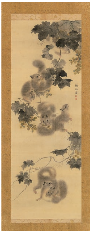
Mori Sosen 《Squirrels with Grapes》