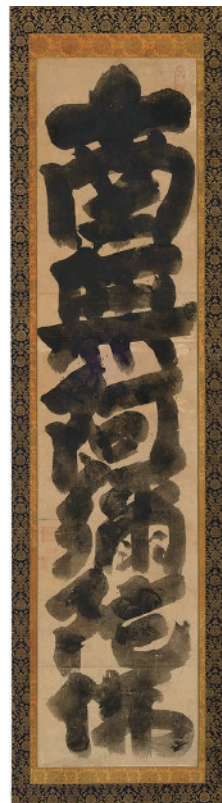
Hakuin Ekaku 《Buddha's Name》