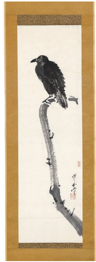
《Withered Tree and Crow in Winter》

This auction will feature 14 diverse works that illustrate his rich expression, showcasing Kawanabe Kyosai's inexhaustible creativity and multifaceted charm.