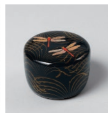
Matsuda Gonroku 《Lacquered Tea Caddy with Red Dragonfly Design》