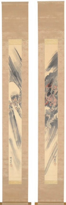
《Fujin (Wind God) and Raijin (Thunder God)》

Kawanabe Kyosai was an artist who was active from the late Edo period to the Meiji era. While based on the traditional painting techniques of the Kano school, he built his own unique world of painting with his exceptional brushwork and unconventional ideas. His high level of skill and distinctive style were highly regarded both domestically and internationally during his lifetime. As a Kano school painter, he received numerous commissions from shrines and temples, and was also widely popular among the general public. He attracted international attention, with many critical essays written about him abroad. Against this backdrop of broad activity, Kyosai left behind a vast array of diverse works, including landscapes, caricatures, Buddhist paintings, and animal paintings.