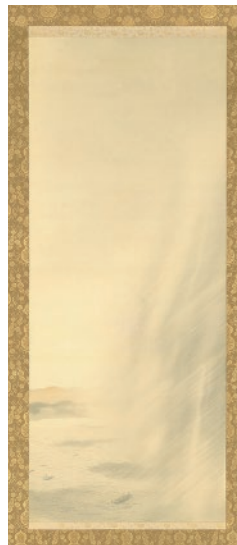
Shimomura Kanzan 《Downpour》