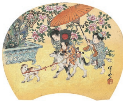
《Seisei Kyosai Uchiwa-e shugajo》 (Kyosai's sketchbook of fan designs): Children Playing Sanbaso》

Other works on display include "Empress Jingu and Takenouchi no Sukune: Boys' Festival Dolls," "Eagle and Rabbit in the Snow," and "Kose Kanaoka's Artwork," showcasing Kyosai's profound knowledge and impressive artistic skill.