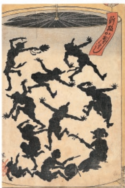
《Shadow Pictures: Tengu Dance》