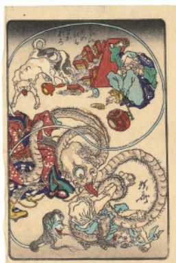
《Kyosai Hyakuzu: Nagai mono ni wa makarero (You Can't Help Getting Tied Up In Long Things)》

When discussing the artistic career of Kawanabe Kyosai, his woodblock prints, including ukiyo-e and illustrated books, are indispensable.